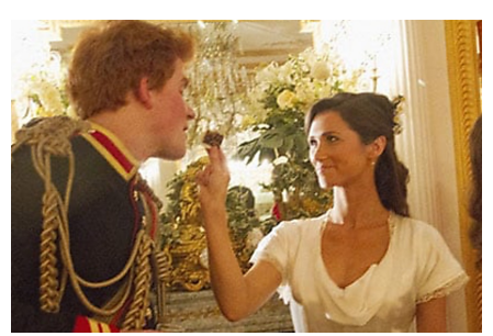
Inside Pippa Middleton's Wedding Reception: The Photos Were Not Suppose To...