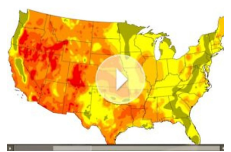
Incredible Map Reveals Energy Discovery That Spans Entire U.S.